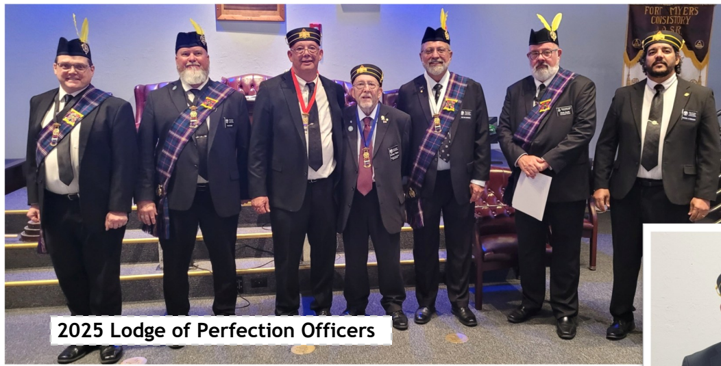
2025 Lodge of Perfection Officers