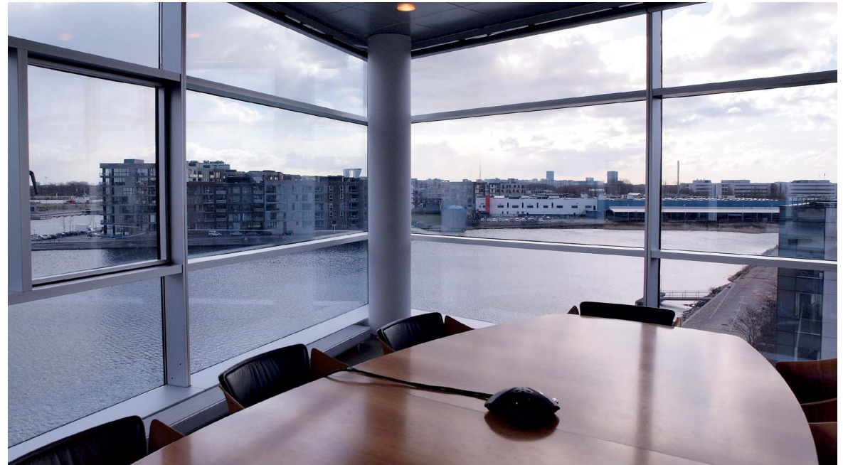
Ideal Applications: Commercial Buildings, Retail