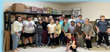
Youth from Pleasant Hill, and FBC Slocomb serving