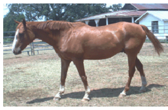
Eagle Spirit is anxious to make friends with the other horses.

Raven Feather is a 21-year-old black Quarter horse, Thoroughbred cross. Eagle Spirit is her 14-year-old son who was sired by a Thoroughbred. Eagle has spent his whole life with only Raven. Life changes have caused the property to be sold, the marriage to end, and the owner to need to move almost all the way across county. The owner went on a search for the right sanctuary for the horses and thought it had been found in Virginia. But after filling out all the paper work, weeks of time, signing