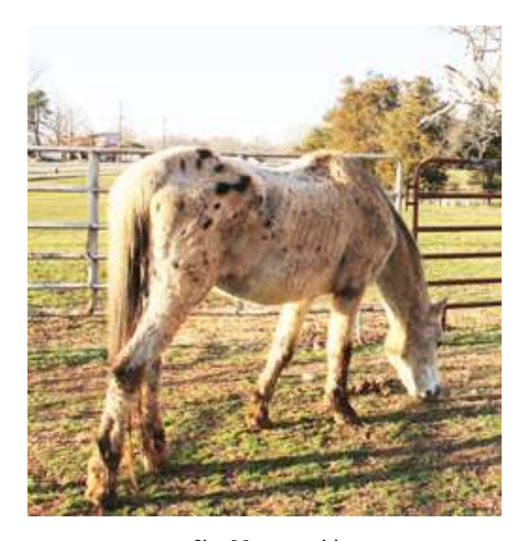
Sky 33 years old