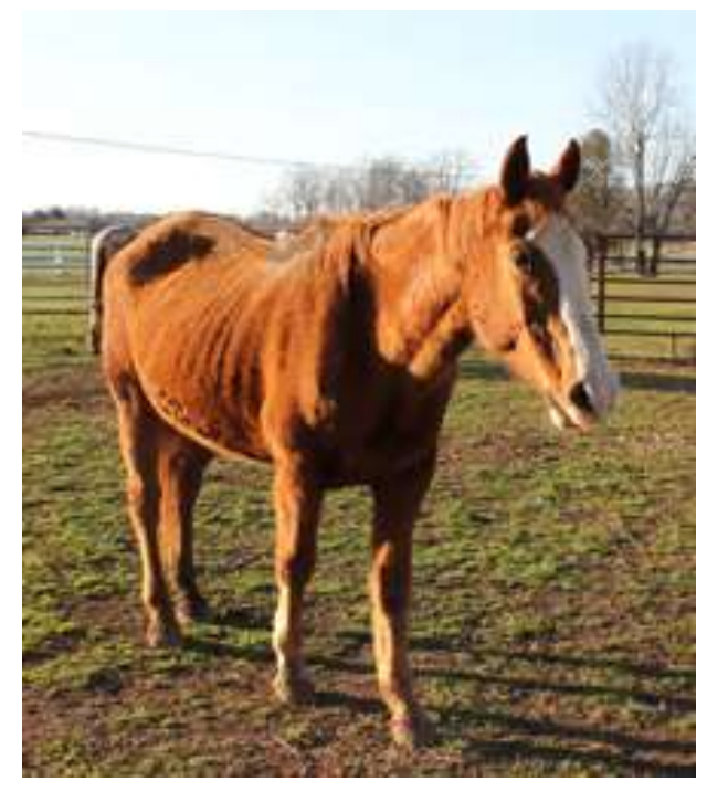
Naavya 33 years old

The girls have graduated to the side field where they have a round bale under a shed all to themselves and each have a stall to eat their grain and supplements with no stress. The two are so sweet!