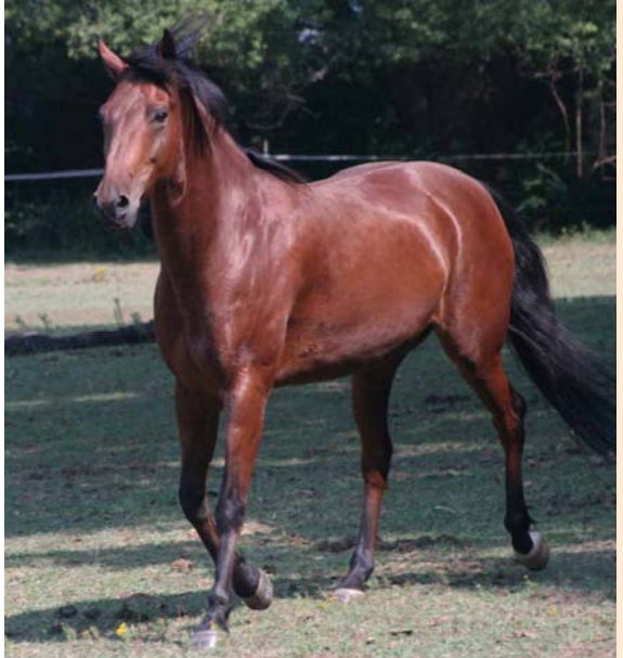
Tacoma January 2012