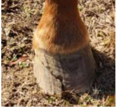
Rising Star's hoof in December