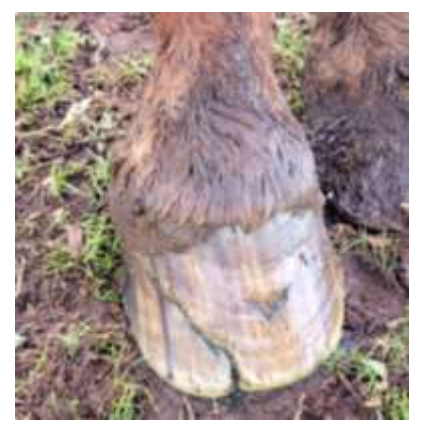
Rising Star's hoof in January 2022 after trimmed by the farrier

Horse Protection Society of North Carolina Inc.