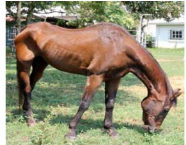
Cree being treated for EPM, doing much better and gaining weight