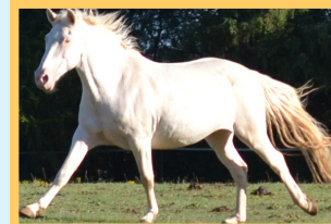
FROSTY (WONDERFUL NEW HOME)