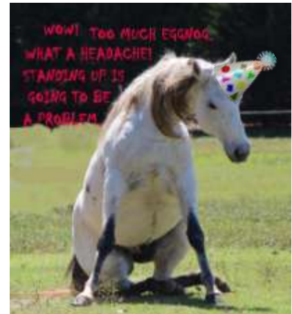
"I'm going to fall down."