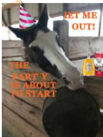
"Just fill my feed pan with rum and eggnog."