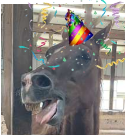
"Give me the peppermint COOKIES!"

These partygoers wish each of you a safe and joyful New Year!