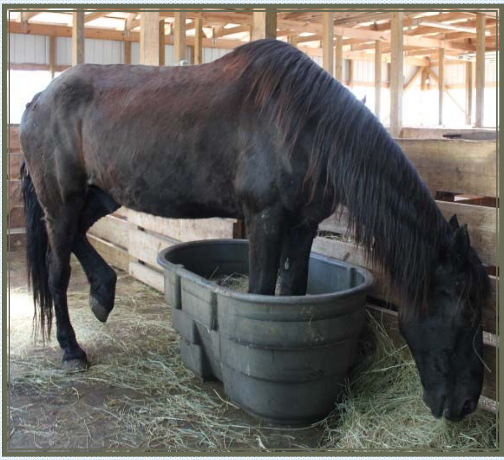
Prairie often stood in his hay feeder, threw the hay out and then ate it off the stall mats. At times he would have all four feet in his hay feeder!