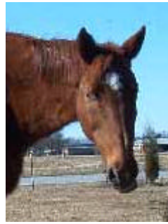
Montana is a special friend of Brown's

Feeding time in the barn - with geese hissing, Irish making faces, chickens clucking - it's a surreal experience for a city woman. From the mucking out of stalls to the deep, rumbling, purring sound of horse greeting - to the soft feel of horse lips on your hand, searching for treats : I have HPS to thank for it all.