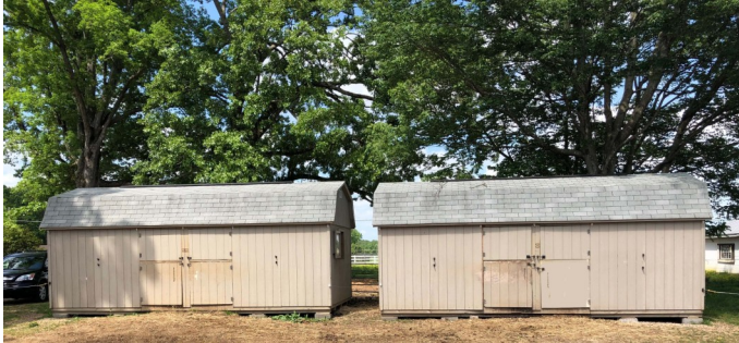
Two of the four portable stall buildings showing the old roofs.

In 2008 HPS had four custom built two portable stall buildings constructed. That gave us eight more stalls that were sorely needed through the economic downturn, and they have served horses well since then. The shingles only had a ten year expected life. Each roof had leaks, and it was time for a replacement and upgrade. Richard Wright of Thomas Allen Renovations and his men removed all the old shingles, replaced the rotted wood, upgraded the underlayment, installed three-dimensional style shingles, and replaced the ridge vents with a larger one that will give better air circulation. Our favorite addition is the metal flashing on both sides of the building on the gambrel. The upgrades on the roofs are a delightful improvement in quality and appearance. The cost was no higher than one company's estimate just to put new shingles over the old ones.