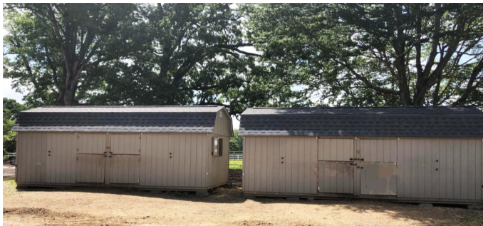
The same two buildings with the new roofs. The improvement of quality and appearance is visible.

This summer there are some repairs needed on the body and the doors of the buildings. Then they need to be repainted. We try to set back funds to maintain the property and the buildings, but this has been a hugely expensive year so far. First the furnace and then the roofs, but we had planned for them, but not the furnace and air conditioning. Don't forget the high cost of removing the mud and adding back all the rock for the safety of the horses. It is impossible to budget for the expenses that we have incurred!