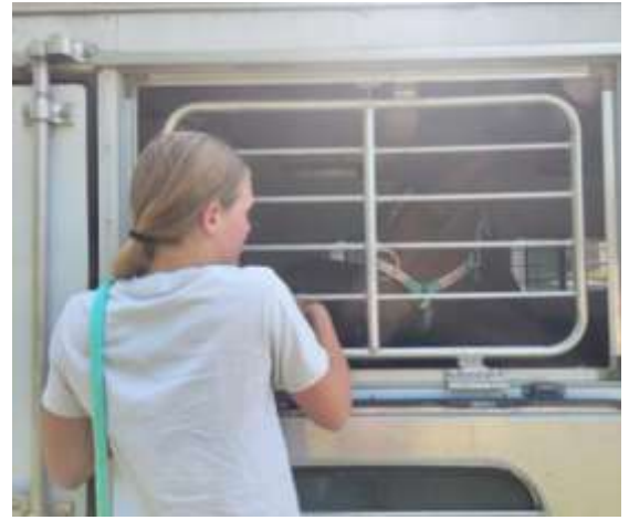
Grace reassuring Honey