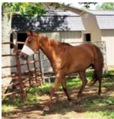
"I don't want to be in the round pen without my boyfriend!"