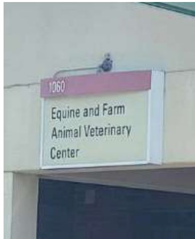
You have to call for an intern to come get Honey.