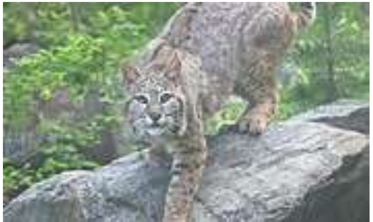
North Carolina Bob Cat — Can weight 40 pounds.

Years ago I did have an extremely large cat take out one of my enormous male turkeys. I followed the trail of havoc that was left with feathers and prints and the chase even went over the top of the old pickup truck. Large scratches were left on the hood. I spread my fingers apart as far as they would go and that was the size of the claw marks. That was a huge cat that killed the turkey! In the same time frame there was a picture in the Salisbury Newspaper of a Black Panther that was seen in the Salisbury area. I never heard anything more about the Panther or where it may have come from or what happened to it.