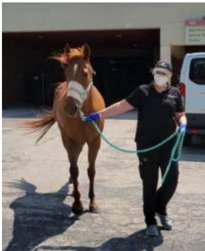
"Is that a fly mask You're wearing?"