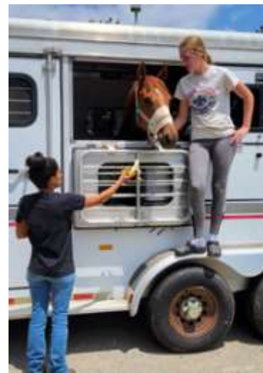
"You can't bribe me with that banana."