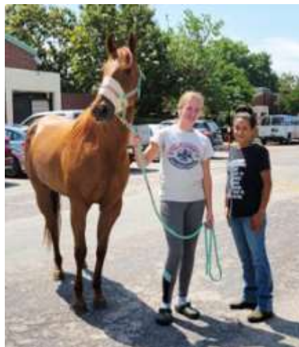
"There is my taxi, let's split out of here!"