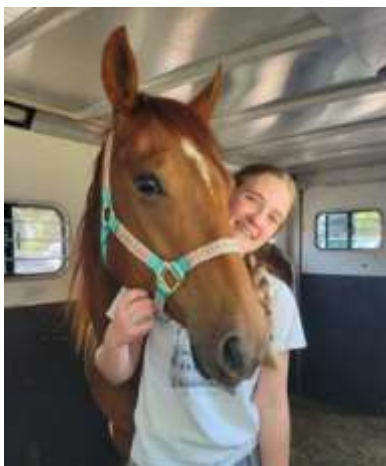
Letting Honey to get ready to get off the trailer.