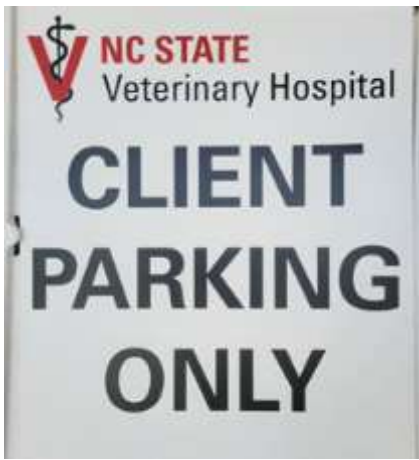
Arriving always feels good!