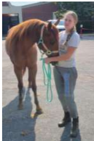
Here comes the intern.