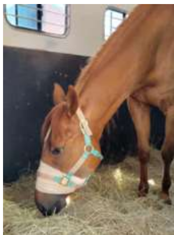
"That is what I wanted, Hay from home."