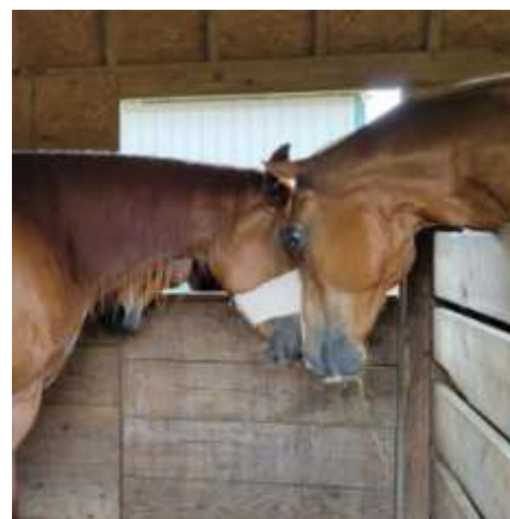
"Freedom, I'm so glad to see you! I like the side field and stalls."