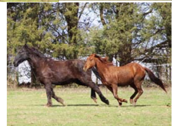
Prairie & Chicopee