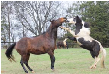
Pecos & Chuckles