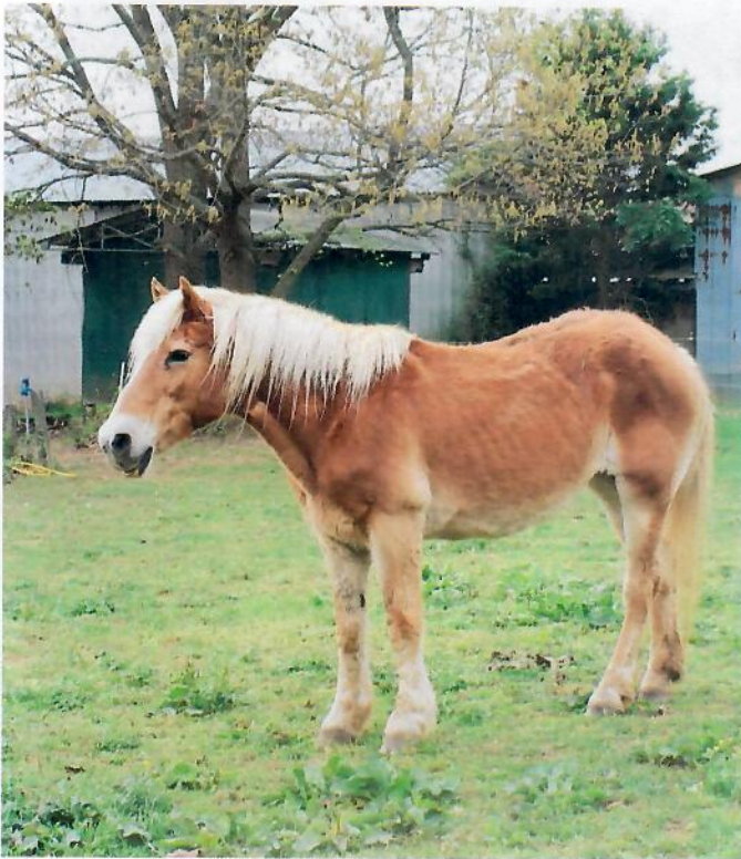
Mazie loves being out with the herd

Mazie would love someone to become her Angel Sponsor and spend time with her. She likes people and enjoys attention.