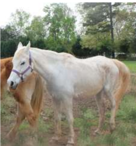
"I'm sleeping, the farrier can wait."

It takes a lot of work to place horses with qualified people, but then there is the exception. One couple lost their companion mare at 32 years old, and their gelding had a nervous breakdown. He left while the folks were not at home. They found him two miles away, and a kind person had put him in their barn for safe keeping. They contacted HPS, and we rushed the application through. The couple wanted a small older mare. A horse that would be harder for us to find a home for. "Happy Dance, Thank you, God." Dazie was a perfect match; she has only been with us for a short time, and this is the ideal solution for her. Small, older horses are difficult to find a home for. She won't be ridden in her new home, just played with, loved on and cared for.