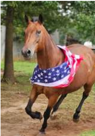
Ginger is a very patriot-

We offered to have her horse come here briefly until the barn was finished. The gorgeous paint arrived at 11:00 p.m. in a 15-horse tractor-trailer. The trailer had a light on around the top of the trailer, and the light in the trailer lit it up like a circus vehicle. Cars on the road slowly passed the massive truck, and I'm sure they