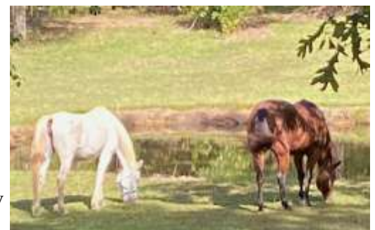
Dazie in her new home with her new pasture mate

It takes a lot of work to place horses with qualified people, but then there is the exception. One couple lost their companion mare at 32 years old, and their gelding had a nervous breakdown. He left while the folks were not at home. They found him two miles away, and a kind person had put him in their barn for safe keeping. They contacted HPS, and we rushed the application through. The couple wanted a small older mare. A horse that would be harder for us to find a home for. "Happy Dance, Thank you, God." Dazie was a perfect match; she has only been with us for a short time, and this is the ideal solution for her. Small, older horses are difficult to find a home for. She won't be ridden in her new home, just played with, loved on and cared for.