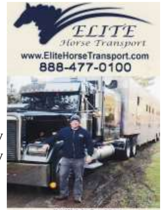
The Ritz Hotel horse trailer.

It also allows the two horses to spend time together before heading to their new home. Ginger will be traveling to the mountains with her beautiful new friend.