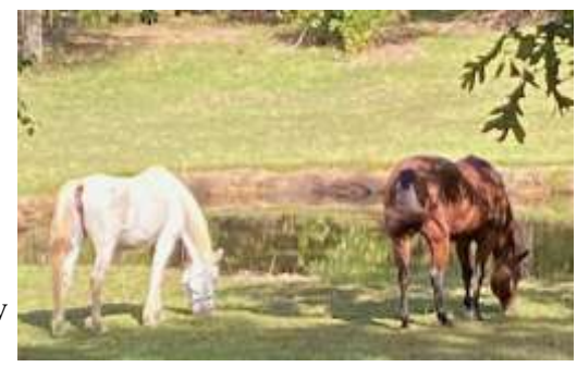
Dazie in her new home with her new pasture mate

would be harder for us to find a home for. "Happy Dance, Thank you, God." Dazie was a perfect match; she has only been with us for a short time, and this is the ideal solution for her. Small, older horses are difficult to find a home for. She won't be ridden in her new home, just played with, loved on and cared for.