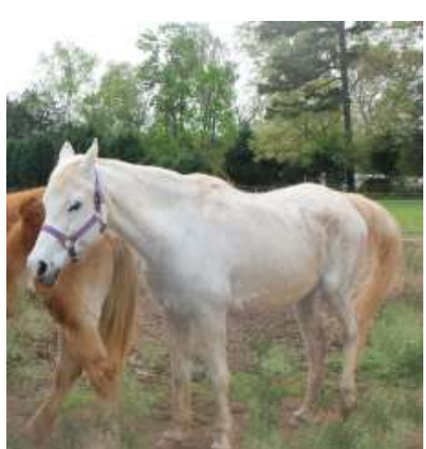
"I'm sleeping, the farrier can wait."