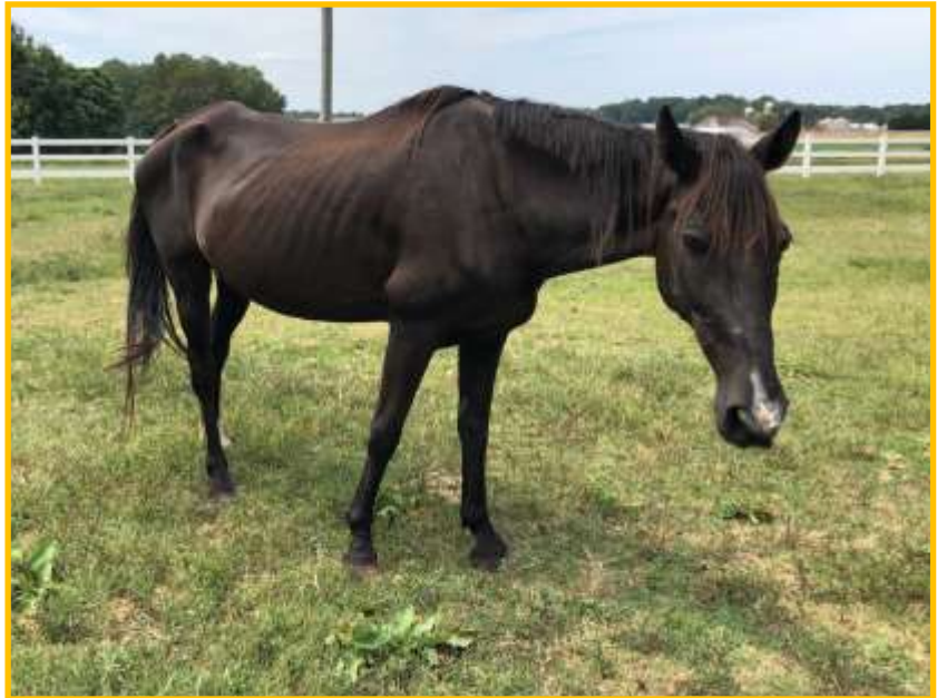
After a few weeks being at HPS.