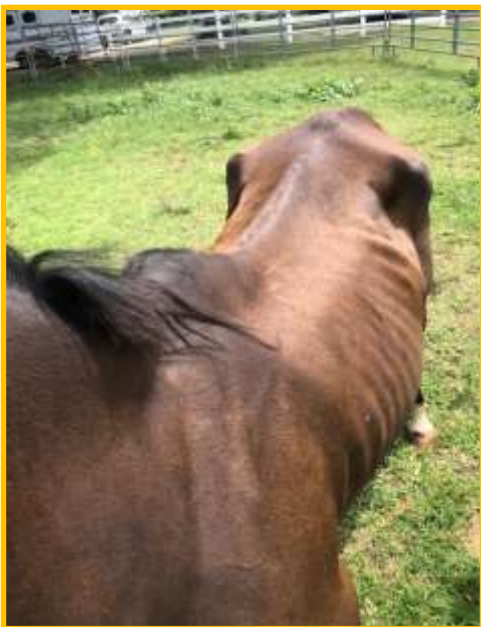
When he first arrived at HPS

He has been with us for a few weeks now. He has the sweetest disposition and loves people. He has already gained a little bit of weight, but when a horse is extremely malnourished, it takes longer than usual to regain that weight. Hopefully, he will continue to gain weight and, when strong enough, can