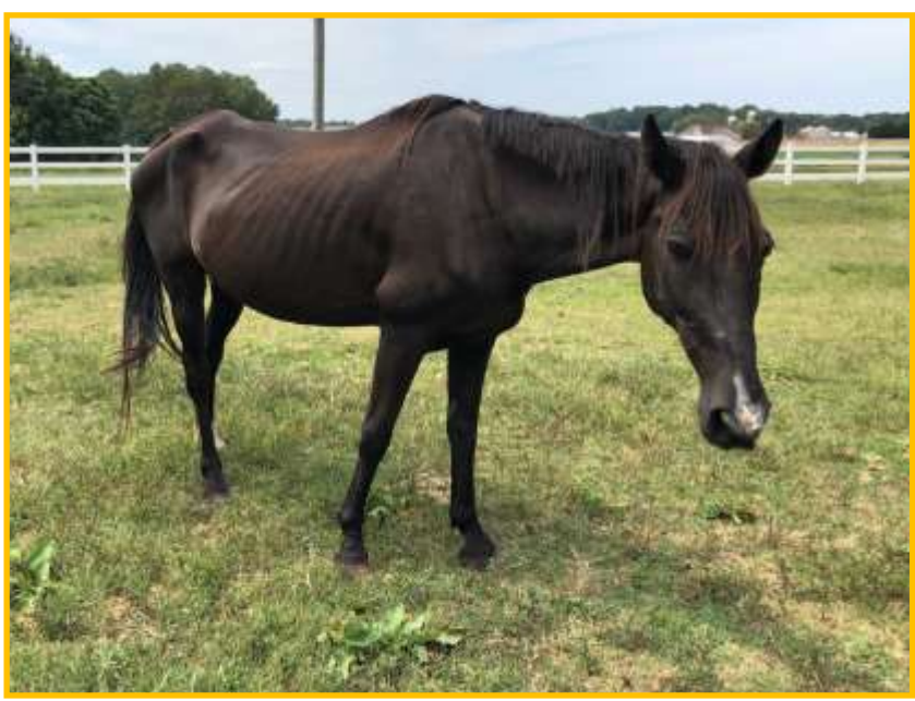
When he first arrived at HPS