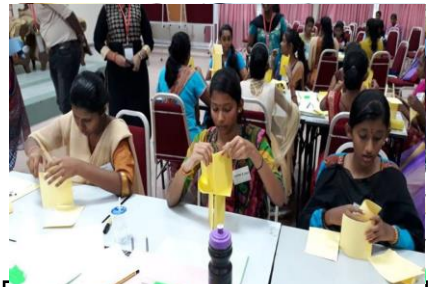
ANBU MAGAAL IPGK TUANKU BAINUN- 2017