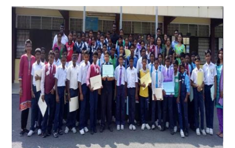
NYAANA OLI UPSR CAMP-SJKT CASTLEFIELD 2018