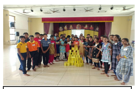
NYAANA OLI SECONDARY SCHOOL CAMP- 2020