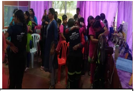
NYAANA OLI UPSR CAMP-SJKT LDG SG MUAR 2019