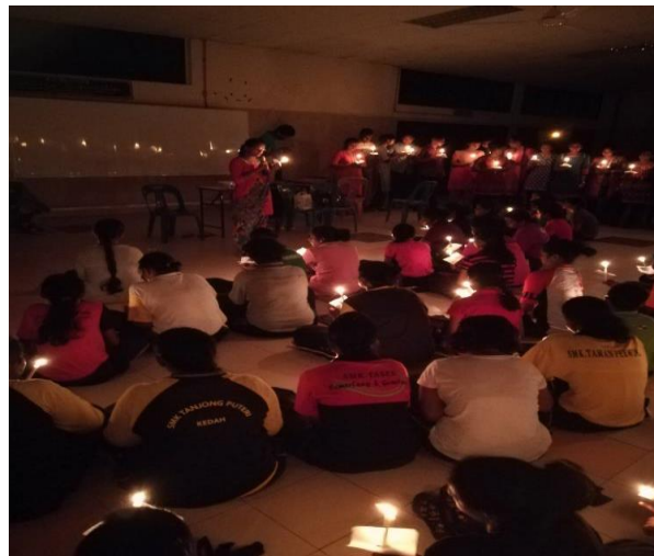
Shared Lights - Symbol of Wisdom