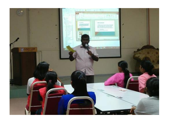
The News Presentation and Discussion

This slot is to bring forward the current issues and enlighten the participants about risks and dangers of the community. The main focus of this slot is to illuminate participants' on the threatening and risky occurrences which leads to their insecurity. Meanwhile, the participants also need to know what are the consequences of getting involved in unhealthy habits like gangsterism, vandalism, physical abuse, bully and other social ills. Each group was given a news and they need to explore it before presenting it in front of their friends and colleagues. After all the presentation, there was a conclusion session on highlighting the risks of the issues presented.