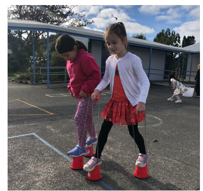
Tinana wā tākaro - movement play activities in Emerald