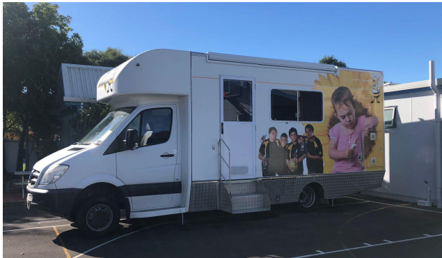
Bee Healthy Dental Bus