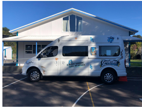
Goodtime Music Bus