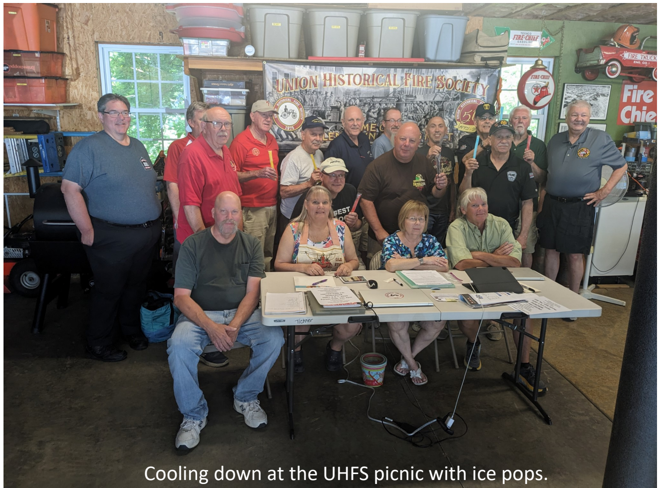
Cooling down at the UHFS picnic with ice pops.