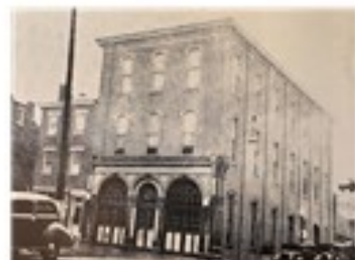
Station House before 1953 renovations