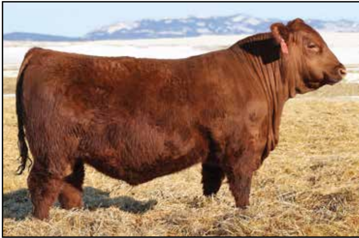
LOT 71 - VGW ARROW 415P