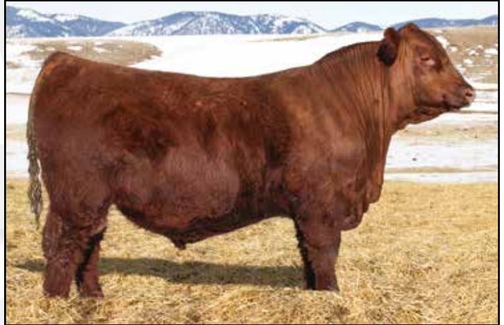
LOT 11 - VGW LOUD 415