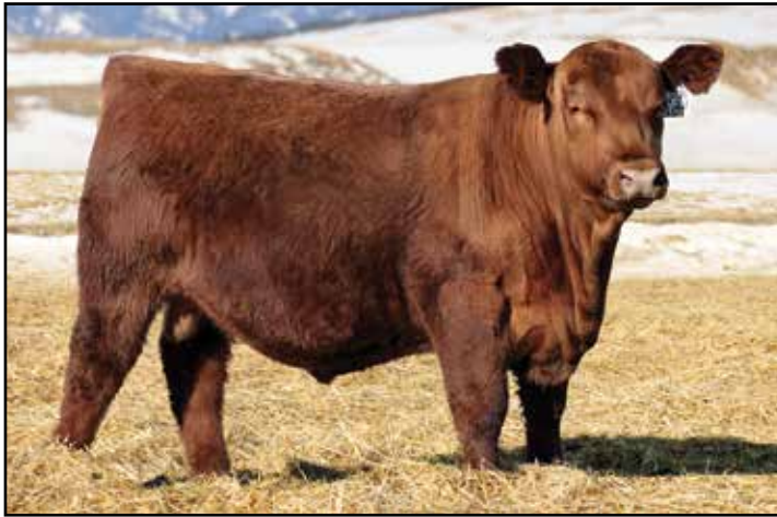
LOT 40 - VGW BRAIN POWER 467