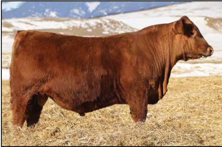
LOT 8 - VGW SILVER 442