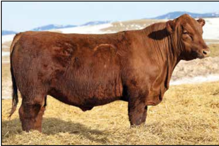
LOT 14 - VGW SPEECHLESS 401