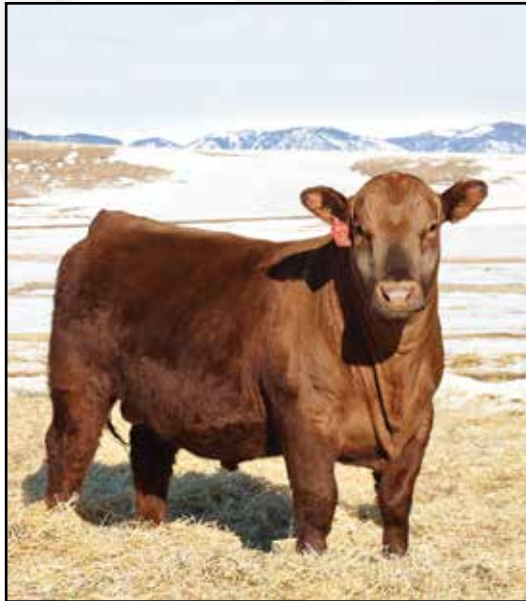
LOT 63 - VGW OVER ALL 406P