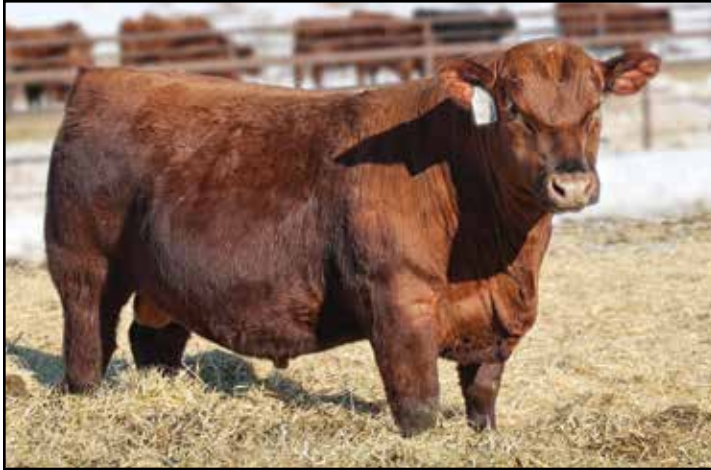
LOT 34 - VGW GRANITE 410