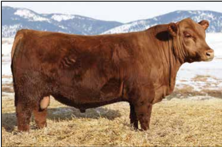
LOT 9 - VGW ALL AROUND 457