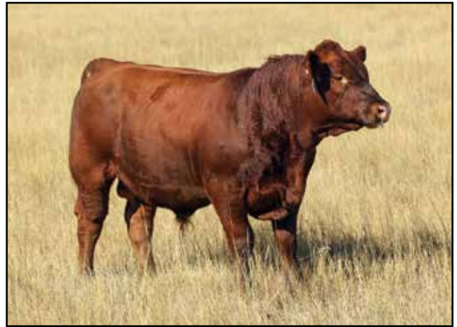
VGW 449 SUMMER PASTURE