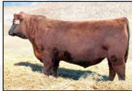
VGW CUTTING EDGE 807 SIRE OF LOT 68