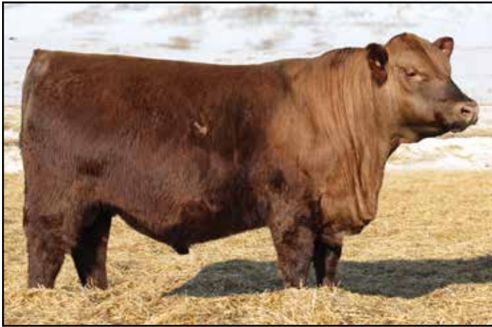
LOT 7 - VGW RED GOLD 416