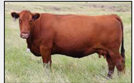
VGW HS-HAZY 1533 DAM OF LOT 70