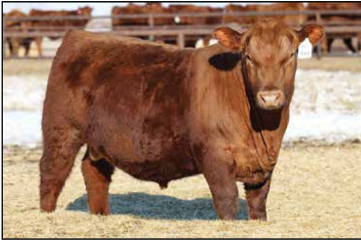
LOT 33 - VGW ROCK HARD 444