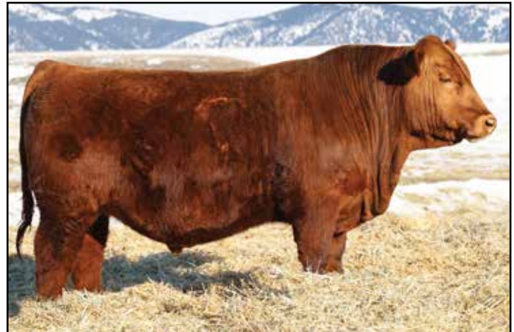
LOT 48 - VGW SOLID 454