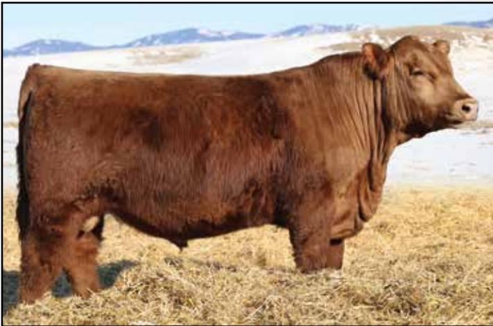
LOT 28 - VGW SUPERMAN 461