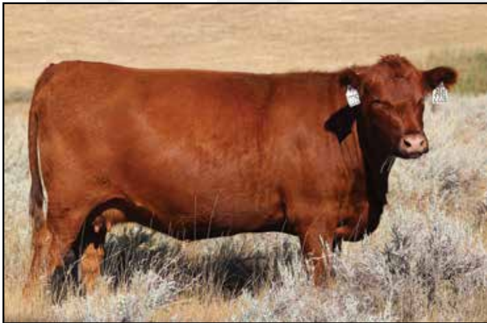
VGW LOT-YOGO 2226 - DAM OF LOT 15