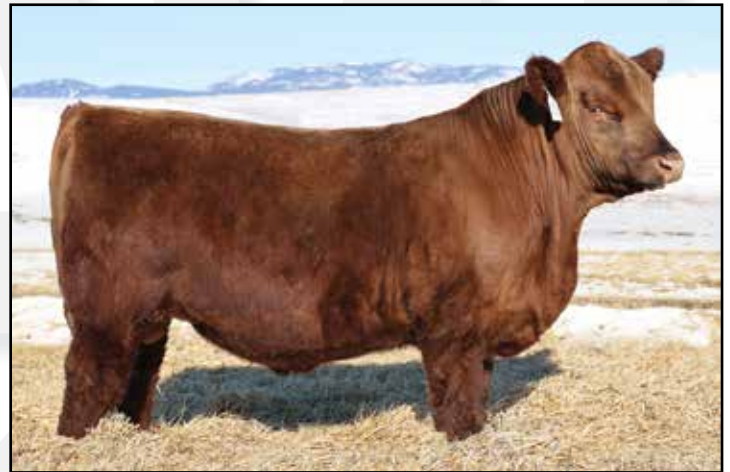
LOT 78 - VGW TROOP 433