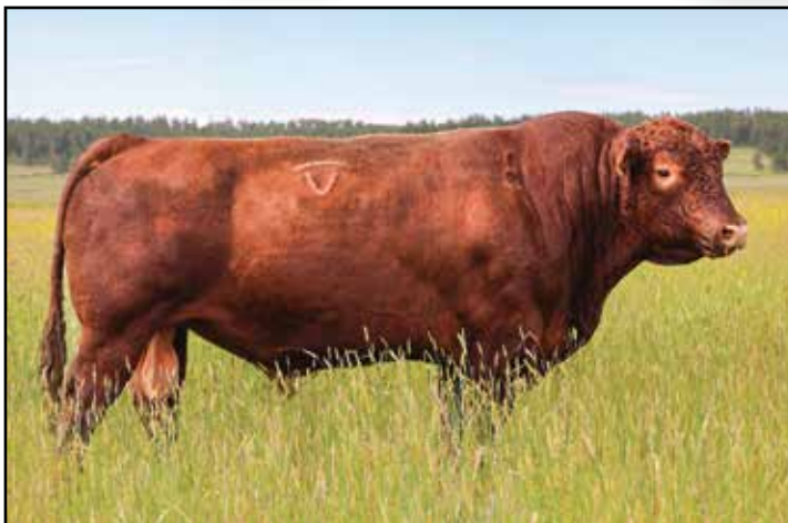
BLL A163 MINDBENDER 21H - SIRE OF LOTS 2, 40-43