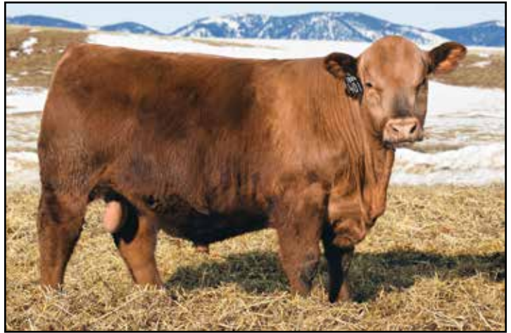
LOT 10 - JKW BUZZ 401