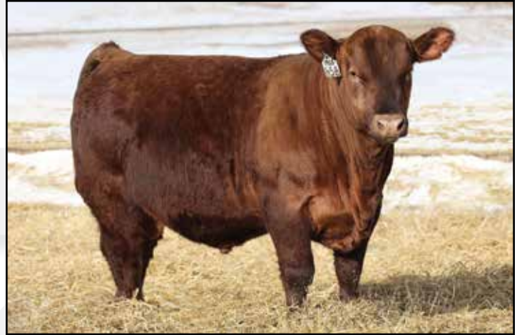
LOT 30 - VGW COAL 458