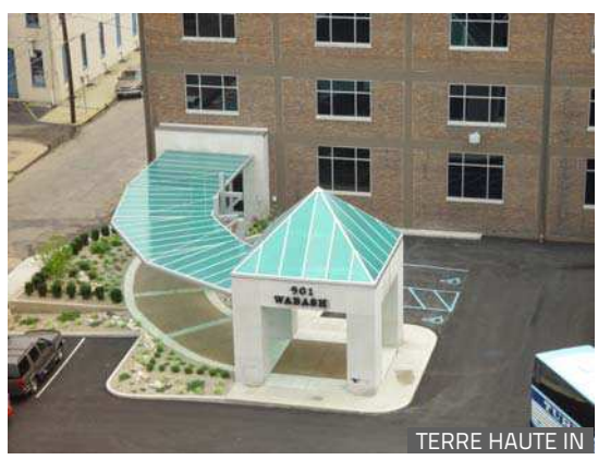
MMS A/E INC. ARCHITECTS, COURTESY PHOTO