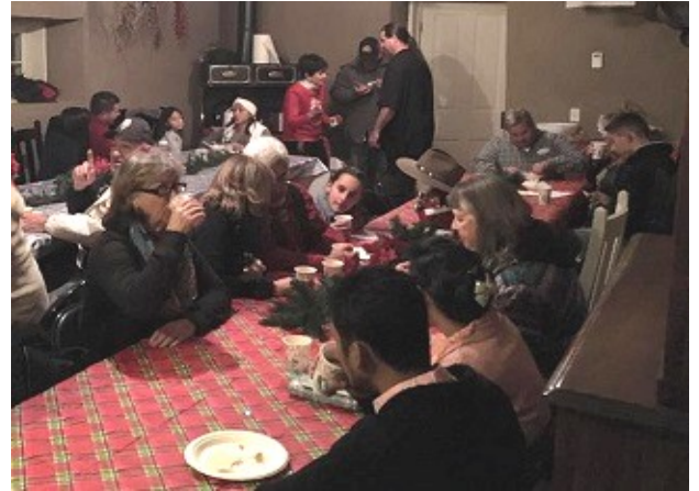
The Holiday Open House was a success again this year. A fine time was had by all!