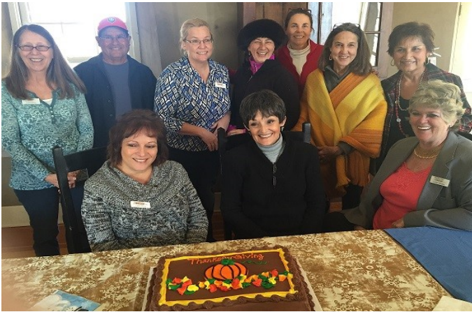
The Hubbell House Alliance thanks the dedicated Museum Guides and volunteers who take time out of their busy schedules to help support the GHH.