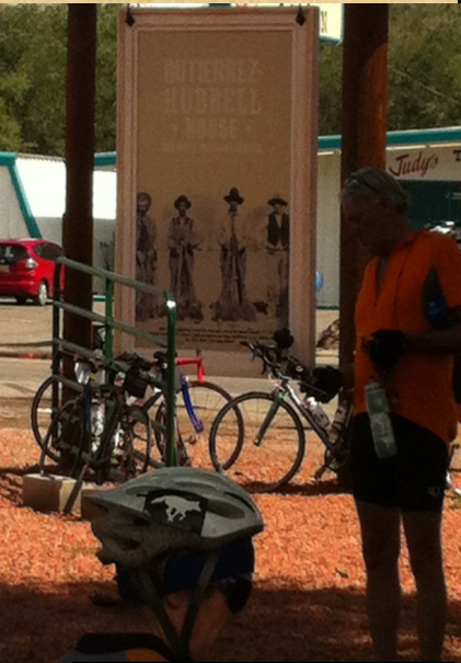
Rest stop for Tour de Rio Grande. Sponsored by Bicycle Coalition of NM