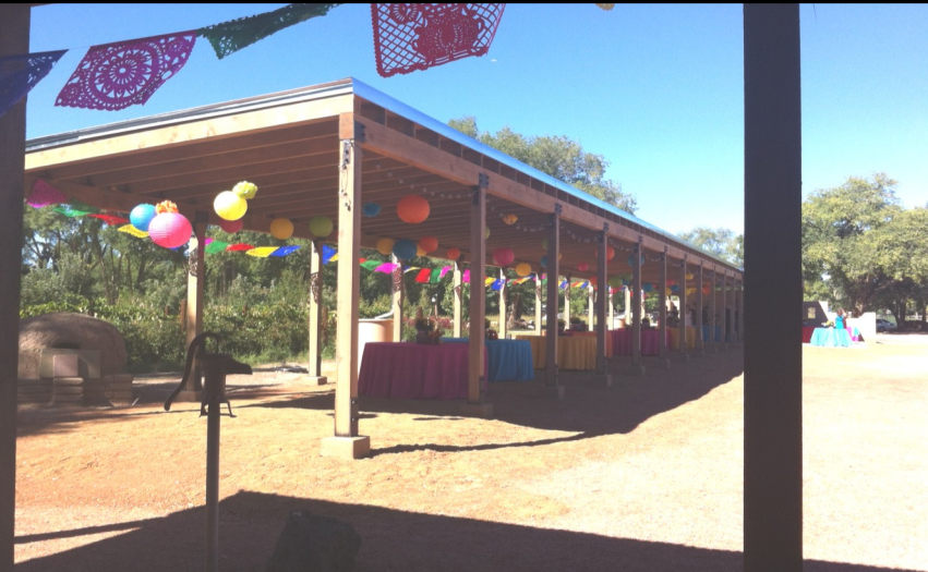
Shade structure up! Thanks to Bernalillo County, Sightworks Inc., Anella Architects and Interstate Builders