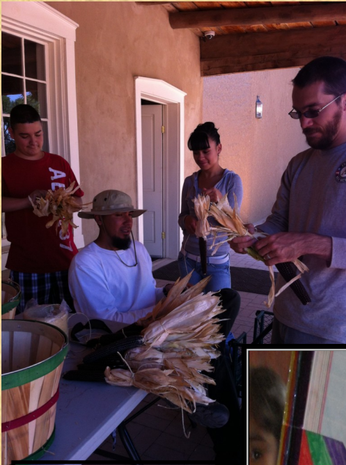
Over 2,000 lbs. of vegetables donated to Roadrunner Food Bank this year