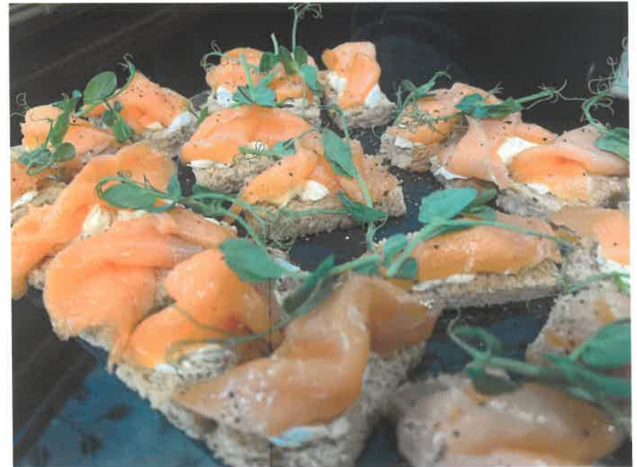
All Canapés in the selection are priced at £6.95

Mini edge butter tart Mini sugar doughnuts Mini tart selection