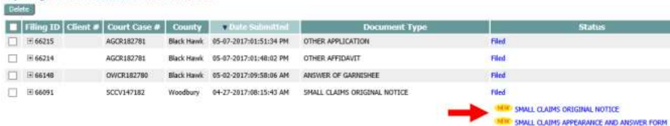
My Filings Between 11/12/10 and 05/16/2017