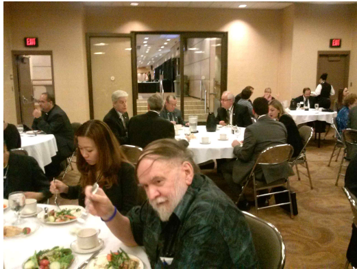
Professors and prospect students at meeting for the foundation of KSU

The course descriptions of the bachelors, masters and Doctors of Theology, Christian Counseling & Healing, Christian Leadership, and Christian Music will be provided in its own separate sheets to students.