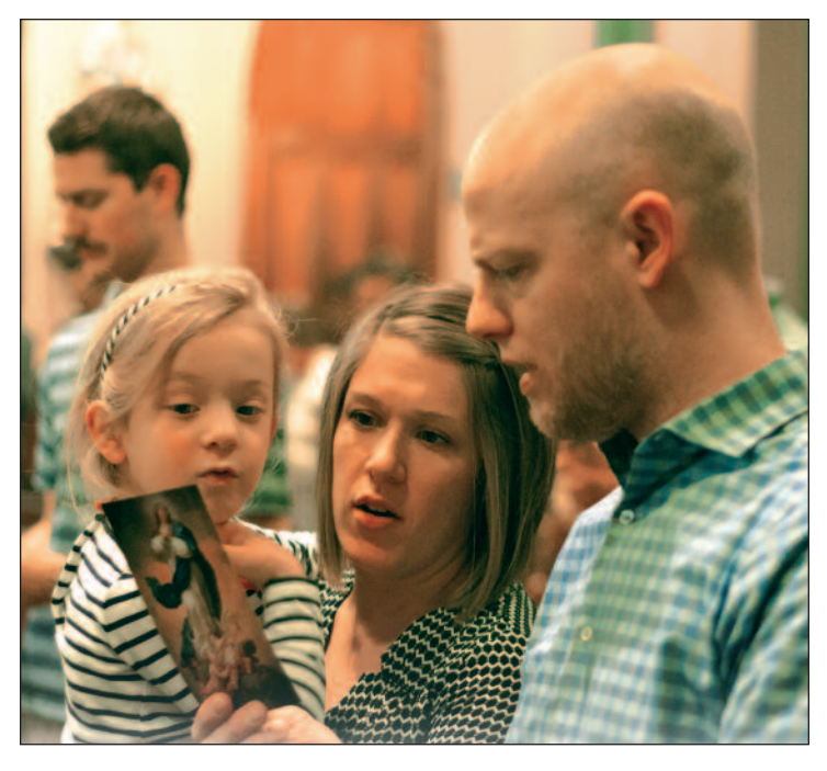
Family Prayer Night Strengthen the bonds within our parishes and build faith-filled families.

Catholics often struggle with the reality that they do not have the opportunity to socialize and/or pray with other faith-filled Catholic families. It can be quite a challenge to raise our children in the faith when their only exposure comes from Mom and Dad. Family Prayer Night is an opportunity for children to be exposed to regular people living their faith in a casual setting. This is an opportunity for council members, their families, and the whole parish community to come together once a month for an evening of prayer, dinner and fellowship.