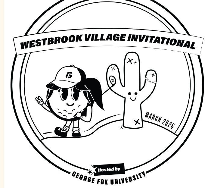
The digital design

I also designed a T-shirt for a tournament the GFU Women's Golf team hosts down in Arizona every March! The team will give it away to the other teams who participate as a tee gift! This is the third consecutive year I've gotten to design the shirt and it's just so fun for me to combine golf and art!