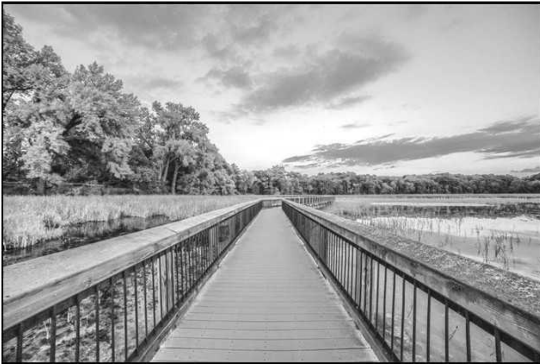
Gray's Bay, Headwaters of the Minnehaha Creek

NALC Branch 2942 Delivers for: Hopkins, Minnetonka, Wayzata, Glen Lake, Eden Prairie, and Deephaven