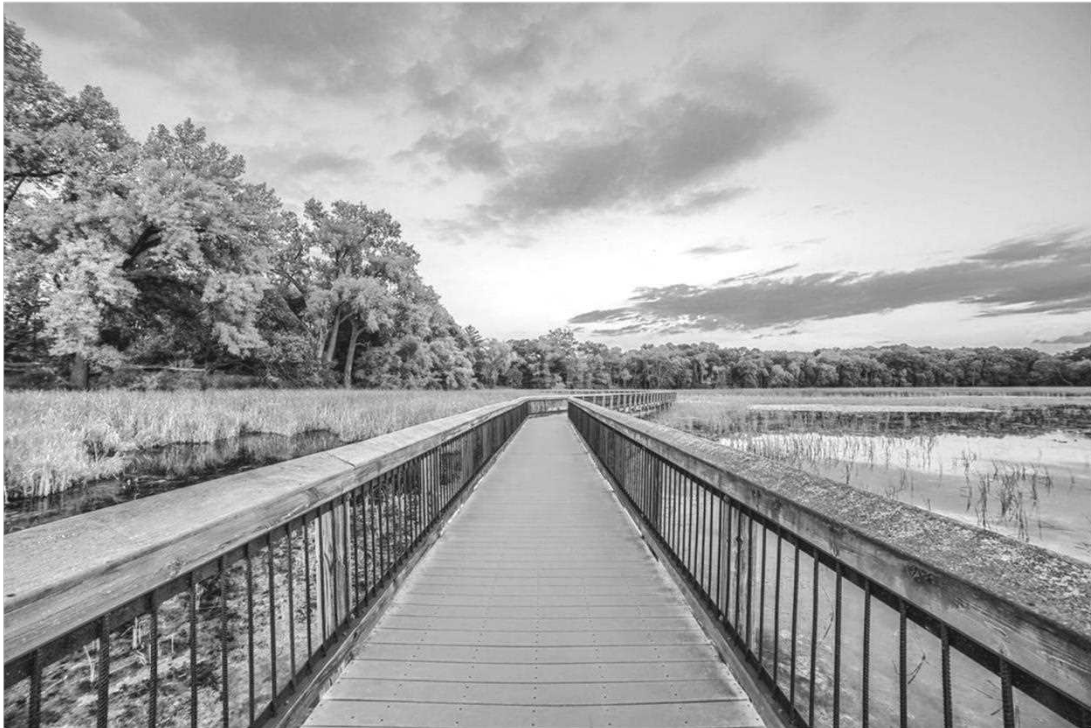
Gray's Bay, Headwaters of the Minnehaha Creek

NALC Branch 2942 Delivers for: Hopkins, Minnetonka, Wayzata, Glen Lake, Eden Prairie, and Deephaven