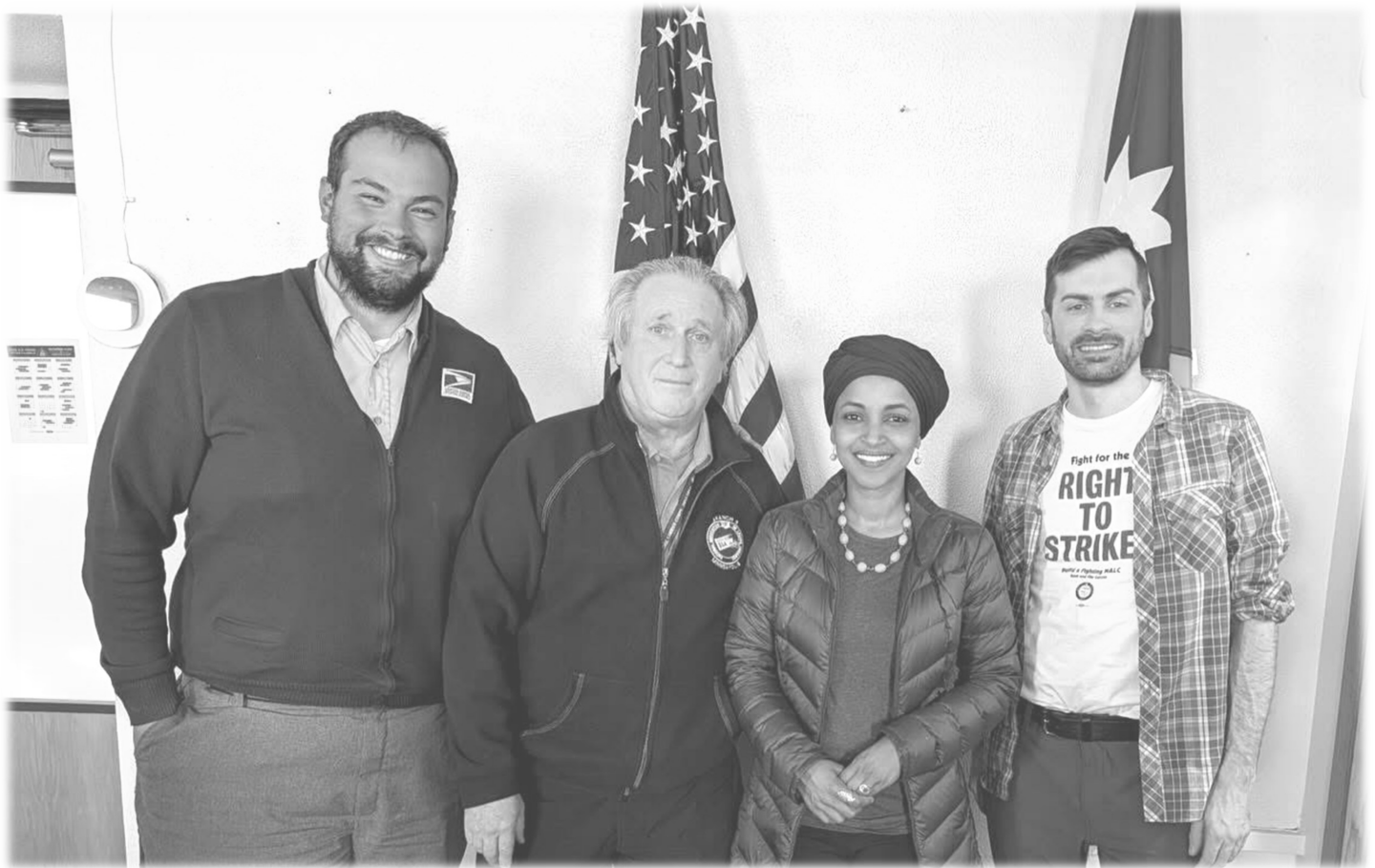
Branch 9 representatives met with District 5 House Representative Ilhan Omar

Omar often brings the human element to technical policy debates. In 2025, she shared the harrowing story of a Minnesota letter carrier whose truck was struck by a speeding vehicle, leaving him with life-altering injuries and PTSD. Omar used this story to fight against "efficiency-driven" reforms that would gut benefits. Ensuring that letter carriers—who account for a significant portion of federal workers' compensation claims—have seamless access to medical care and financial stability when tragedy strikes.