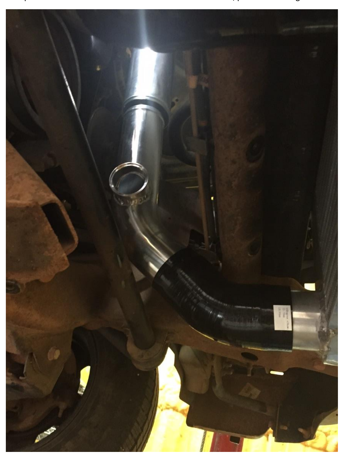
"Tip." Its easier to install the actual BOV on the work bench, prior to installing this tube.

Moving on to the Drive side starting at the intercooler. Install the 45' silicone coupler. Once installed it will need to be rotated slight inward. Then install the 45' aluminum tubing that has the blow off valve. The BOV is aiming inward.