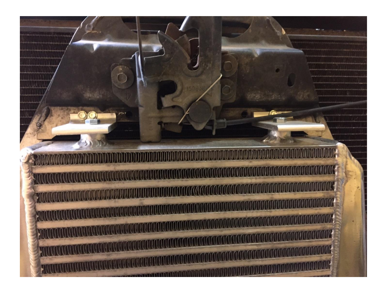
!!!!!!! As you install your silicones remember to slip your t-bolt clamps needed for that silicone!!!!!