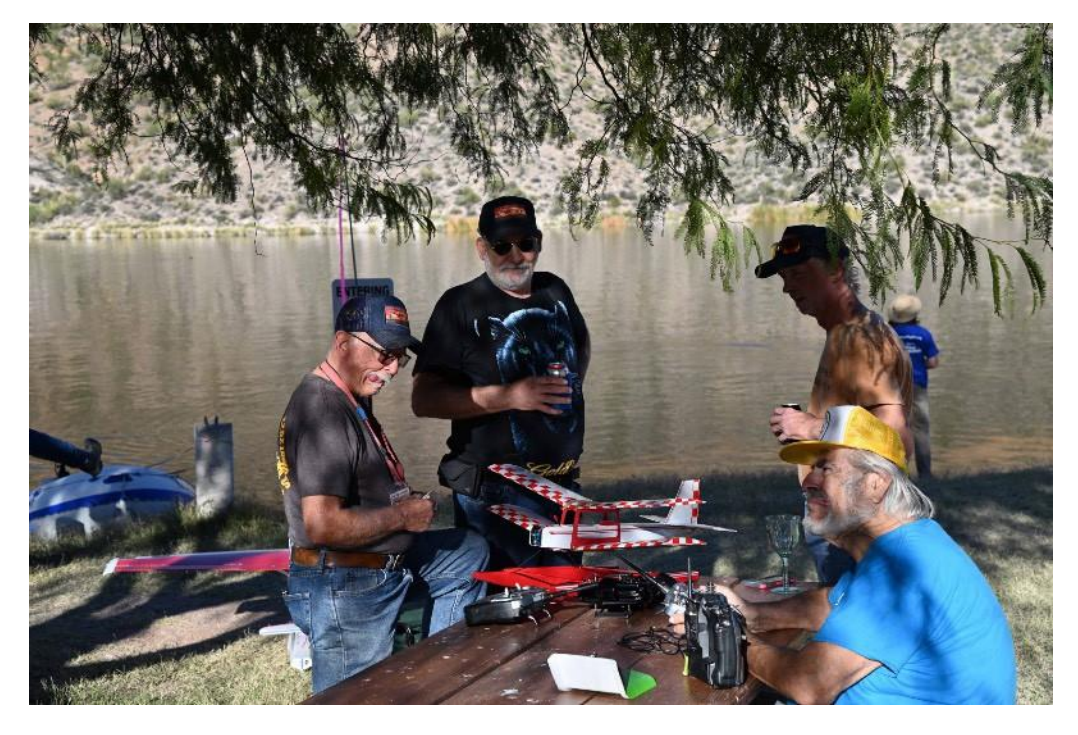
Great minds trying to determine if she will fly. ????? It did!