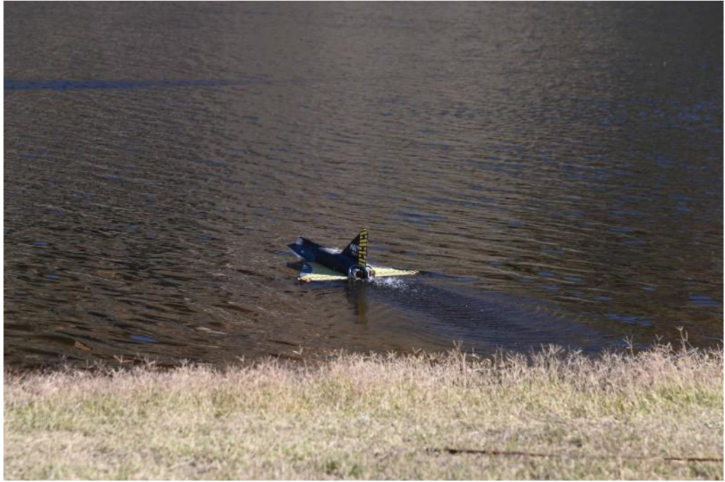
Above, Navy experimental delta wing jet, Convair F2Y Sea Dart.