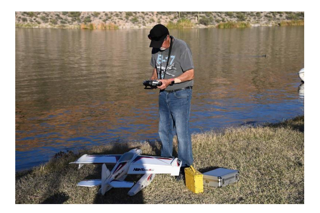
Final preparations before takeoff.