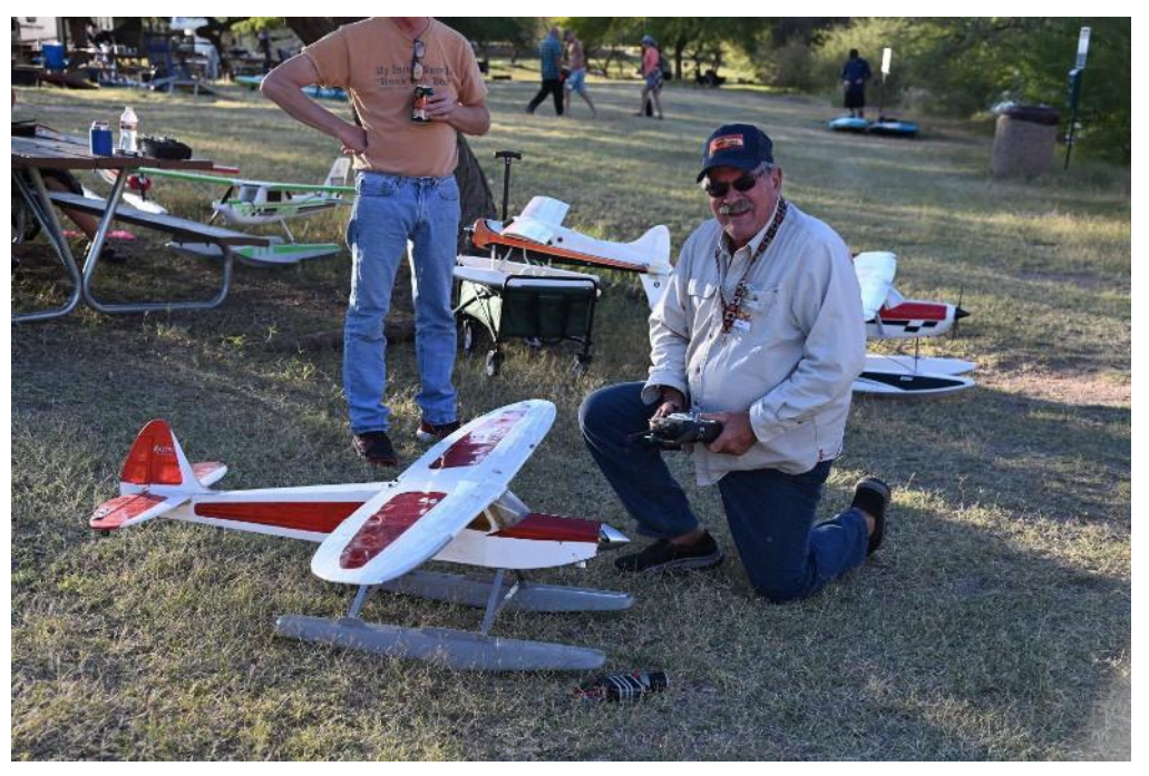
Above, a SIG Rascal on floats. A great flying plane!

A gorgeous 82" Scale Twin Otter is a scale model of the UV-18 'Twin Otter' and the military version of the DeHavilland DHC-6 on takeoff plane.