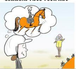
TO HIGHLIGHT ANY LITTLE PROBLEMS YOU MIGHT OTHERWISE HAVE MISSED