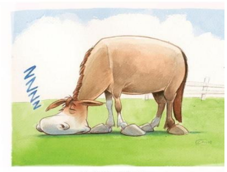
Workin' hard for the money.