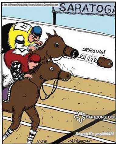
Upon review of the finish photo, race officials discovered cheating on the part of Turf King.