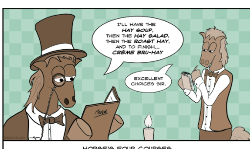
HORSE'S FOUR COURSES