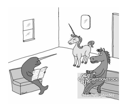
"Mom, Dad, you've never believed in me! How come nobody believes in me?"