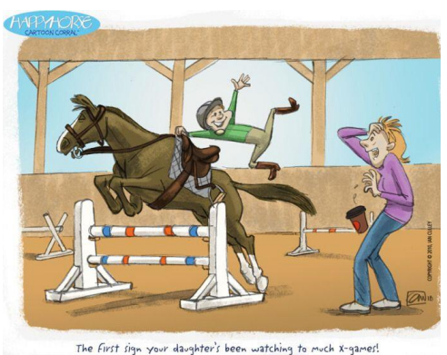
The First sign your daughter's been watching to much X-games!