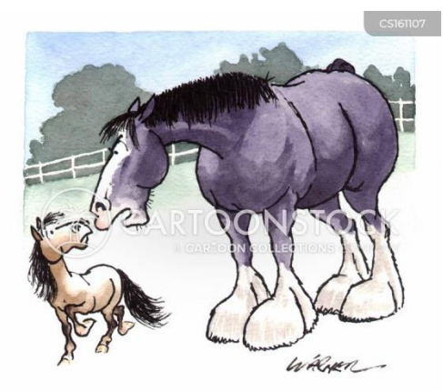
"You're worried about the price of shoes!"