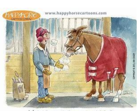
Let's start the year off with our ears forward, shall we?