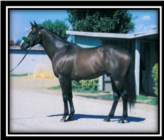
PIRATEER Stakes winner of $108,463