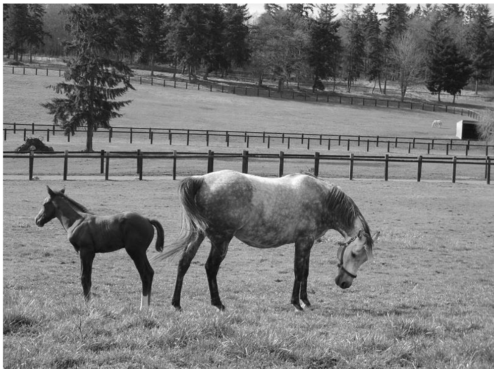
YOUR NEIGH-BORHOOD HULLABALOO