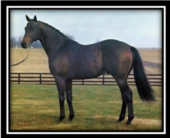
GALLANT BEST Major NY Stakes winner of $248,963