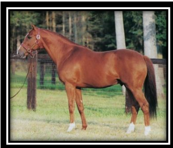
HANDSOME ONE Major stakes winner of $387,575

Book online at www.wildwoodfarmbandb.com