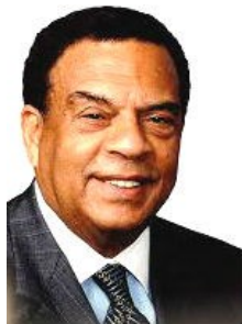
Andrew Young Civil Rights Activist/Politician

Andrew Young, Jr., came into prominence as a Civil Rights Activist and close associate of Dr. Martin Luther King, Jr., during the modern Civil Rights Movement in the United States. He worked with various organizations early in the movement, but his civil rights work was largely done with the Southern Christian Leadership Conference (SCLC) where he served as an Executive Director and later Executive Vice President. Young served on the Board of Directors until 1972.