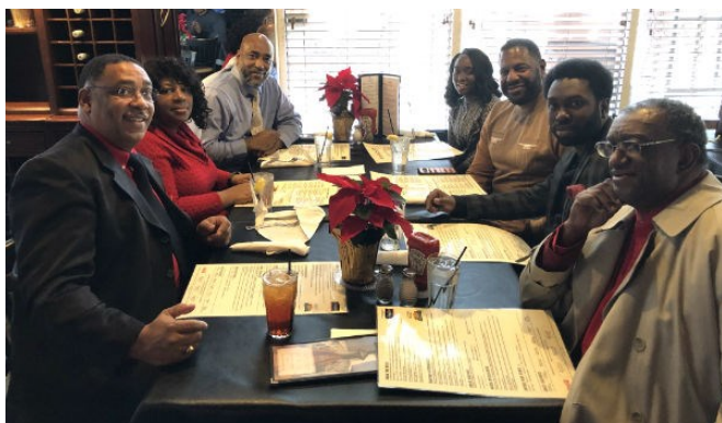
Our Music Ministry gathered for dinner and fellowship at Nantucket's to celebrate the Christmas season.