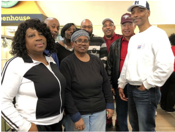
Members of the Ushers Ministry gathered at Golden Corral to celebrate the Christmas season.