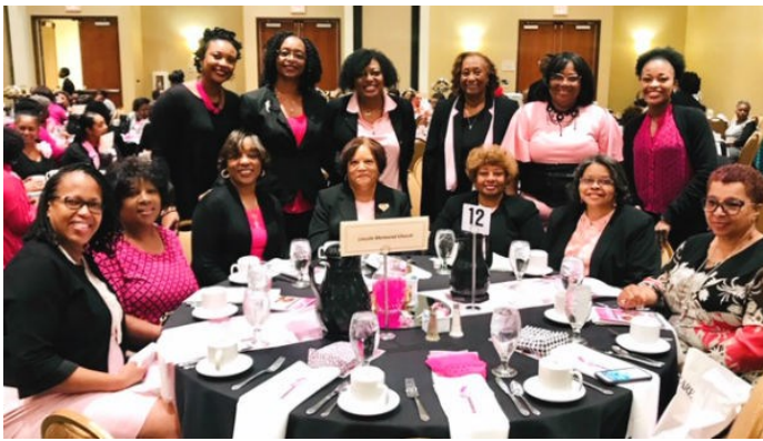
Feasting on a buffet of spiritual food while nourishing their physical bodies, several women from the Lincoln family joined with other believers at the Prayer Breakfast Fellowship sponsored by Union Baptist Church.