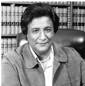
Constance Baker Motley Civil Rights Activist

Constance Baker Motley was born on September 14, 1921 in New Haven, Connecticut. She was the ninth child in a family of 12 children.