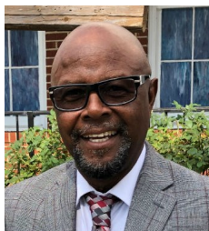
Deacon on Duty for the month of September: