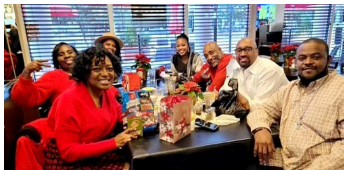
Members of the Trustee Ministry gathered for a Christmas fellowship at Nantucket Grill to celebrate their work and the true reason for the season! Thank you Trustees for all of your work in aiding the operations of our church.