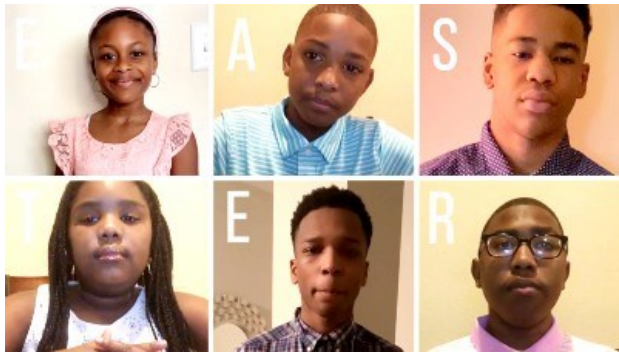
Youth members from the Sounds of Joy provide spiritual recitations based on Easter acrostic.

Led by our Christian Education Ministry, the Lincoln family remembers and honors the awesome sacrifice of our Saviour in observance of Good Friday. Our service featured the reading of selected scriptures, musical performances and a tribute from our youth. The service provided a vivid illustration of the fact that although we may be socially distanced as a church family, nothing will separate us from the love of Christ.