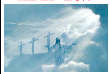
I am the resurrection and the life. He who believes in Me, though he may die, he shall live.

Resurrection Sunday March 31, 2024 HE LIVES!!