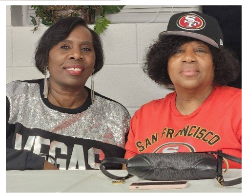
Congratulations to all of our Fantasy Football League participants on an outstanding season!