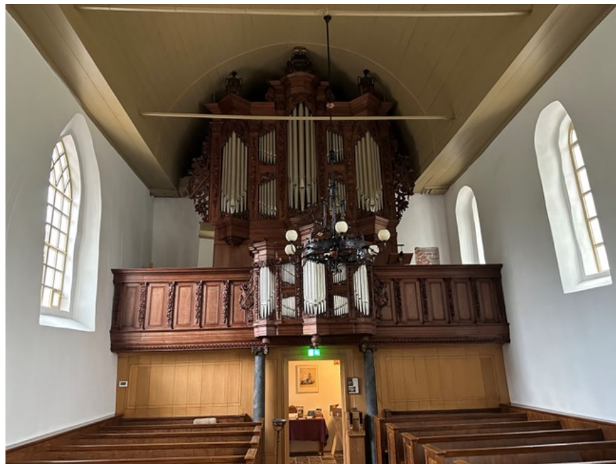
Huis/Freytag/ Lahman 1833