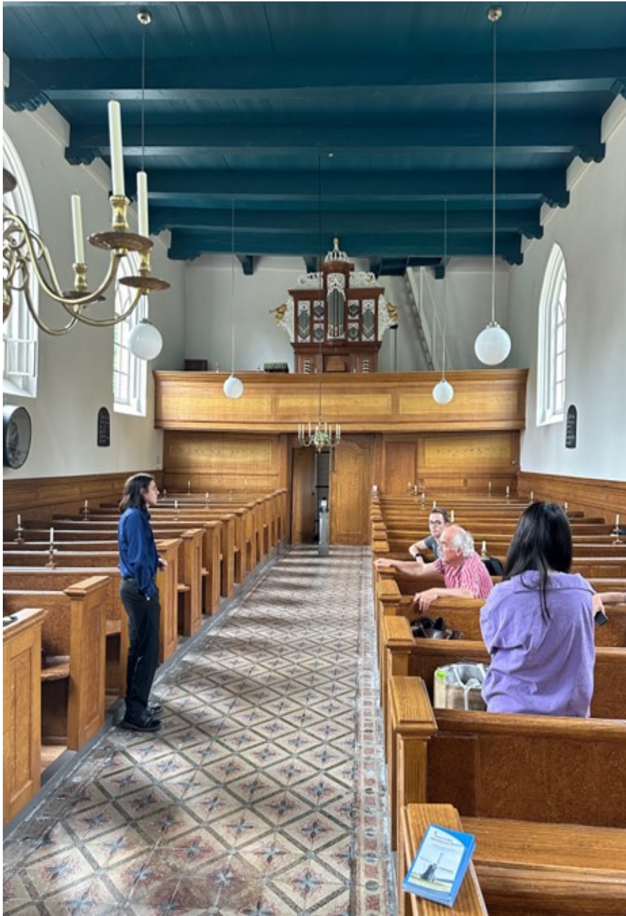
Nieuw Scheemda organ Schnitger 1699