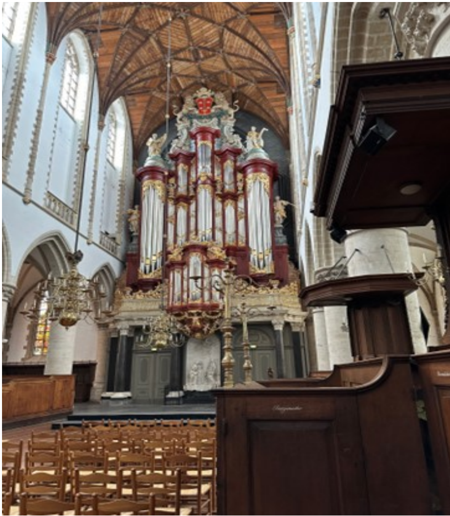
St. Bravo Haarlem Muller 1738