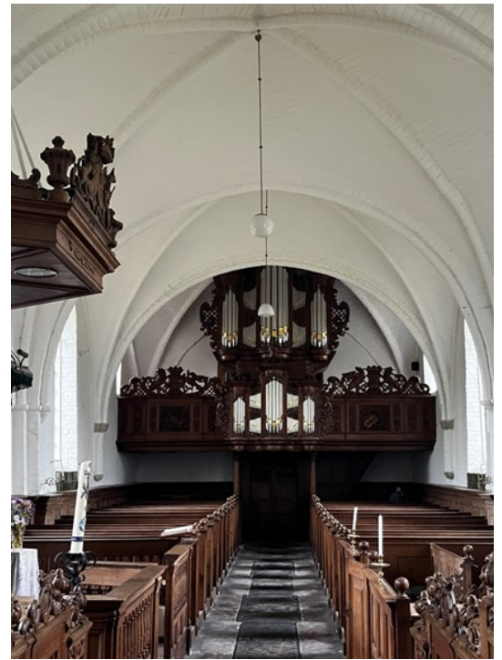
Zandweer Schnitger/ Freytag 1795