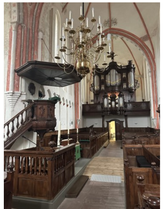
Zuidbroek Schnitger/ Freytag 1795