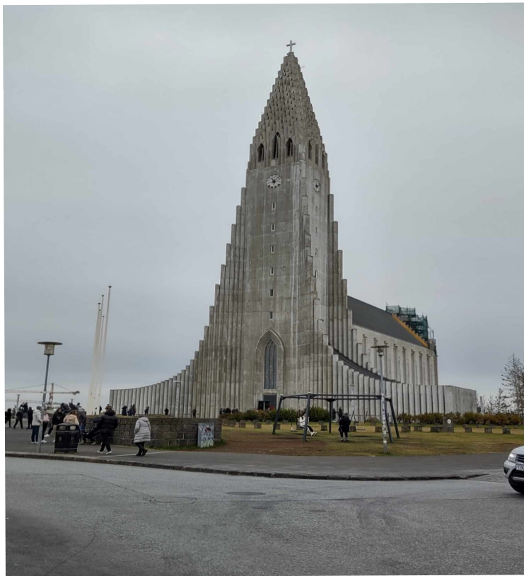
HALLGRIMSKIRKJA LUTHERAN PARISH CHURCH IN REYKJAVIK, ICELAND